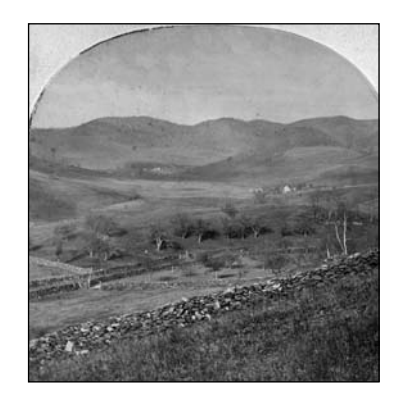
McKie Valley showing Snake Hill and Sugar Loaf Mountain in the distance.