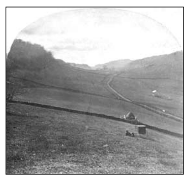
Looking up McKie Valley, showing Two-top and Pittstown Mountains. Stereoscopic Views published by L. F. Hurd, Greenwich, New York.