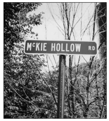
McKie Hollow Road, 2000.